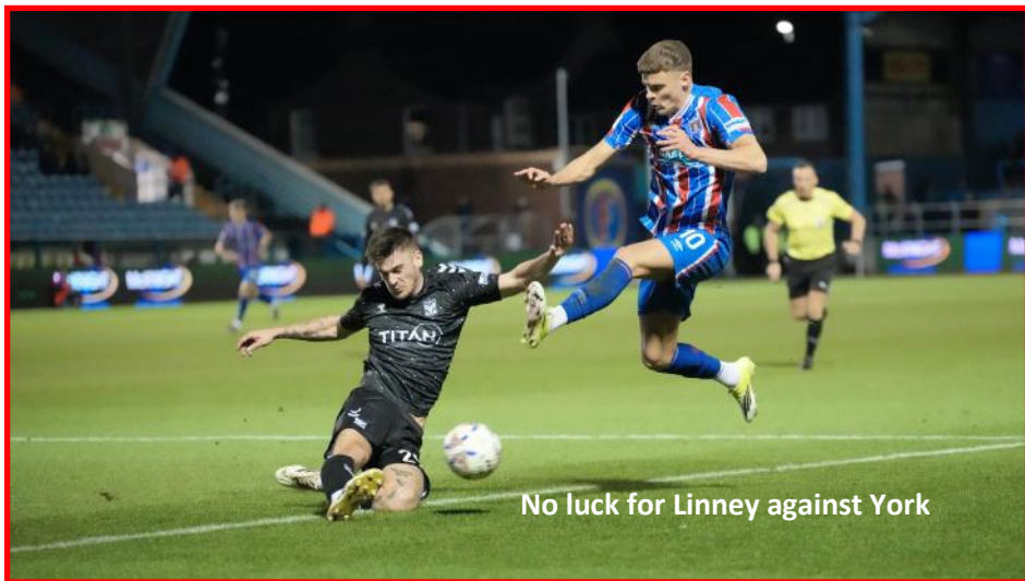
No luck for Linney against York

Wearne to help fill in the attacking midfielder shaped hole in their line-up.